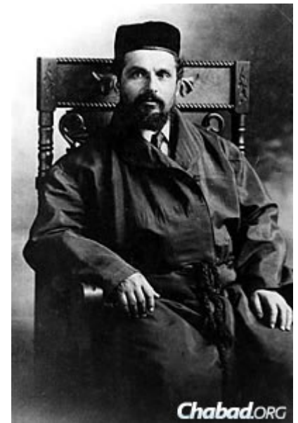
The rabbi in his younger years